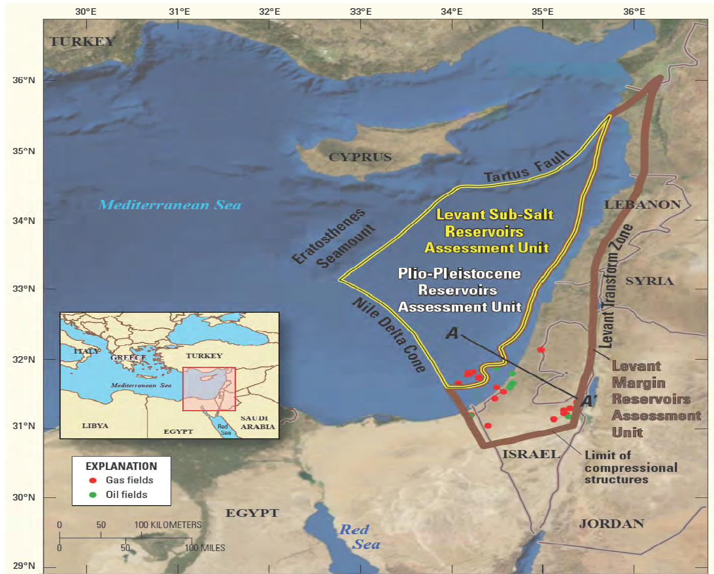
Figure 1. Location of the three assessment units (AU) in the Levant Basin Province in the Eastern Mediterranean. The boundaries of the Levant Sub-Salt AU and the Plio-Pleistocene Reservoirs AU